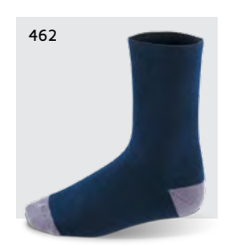
6WWS Work Sock (3 Pack)