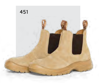
9E1 Elastic Sided Boot