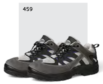
9F6 Safety Sport Shoe