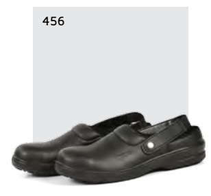
9C1 Microfibre Clog