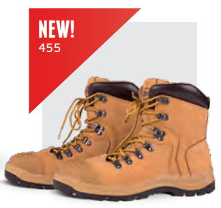
9F7 7 Eyelet Lace Up Boot