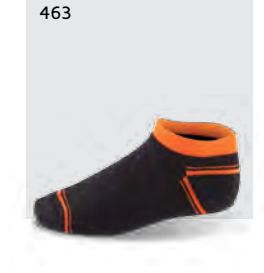
6WWS1 Ankle Sock (3 Pack)