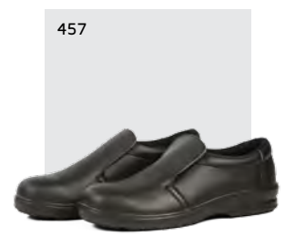
9C2 Microfibre Shoe