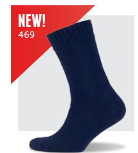
6WWSU Ultra Thick Bamboo Work Sock