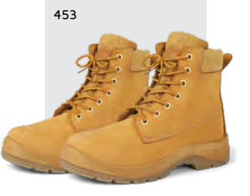
9F5 Lace Up Outdoor Boot