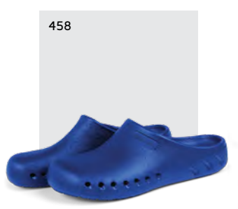
9C3 Slip Resistance Clog